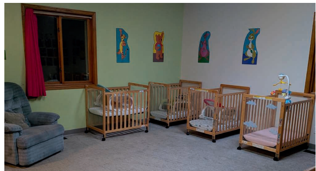
At the time of publishing, Lil’ Gov’s Bright Beginnings provides childcare for 30 children, including space for five children under 1 year old. Submitted Photo