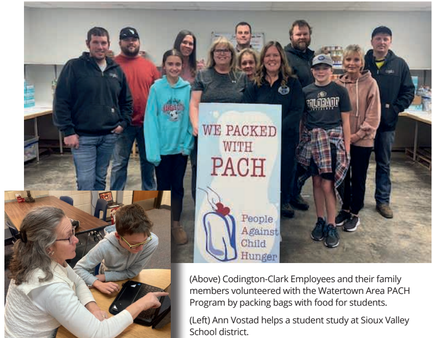
(Above) Codington-Clark Employees and their family members volunteered with the Watertown Area PACH Program by packing bags with food for students.

"They look forward to it," she said. "Once you do it, you want to keep coming back."