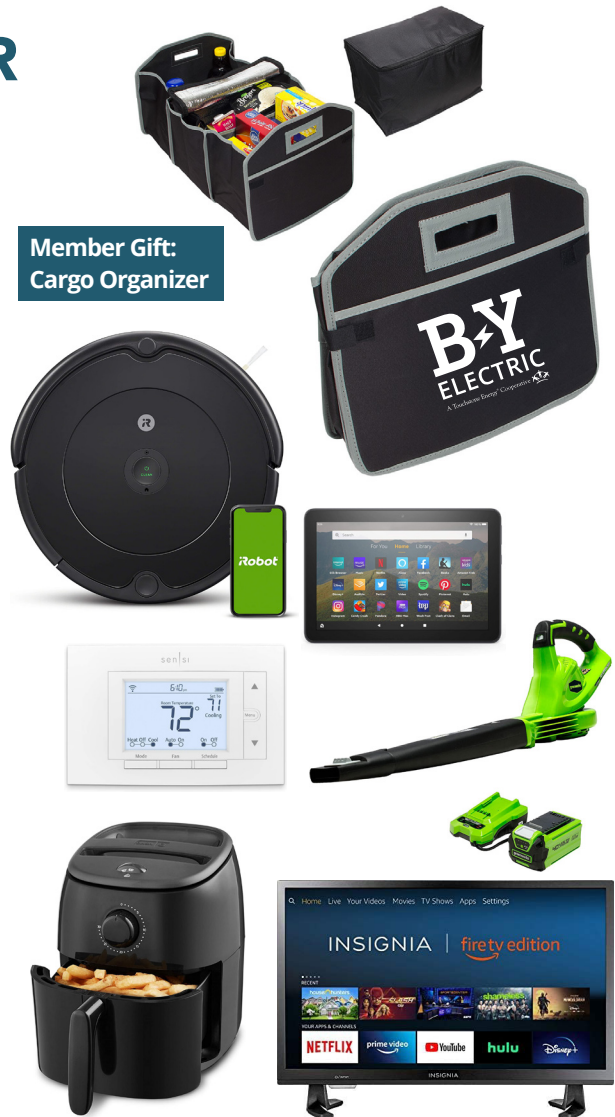
Member Gift: Cargo Organizer