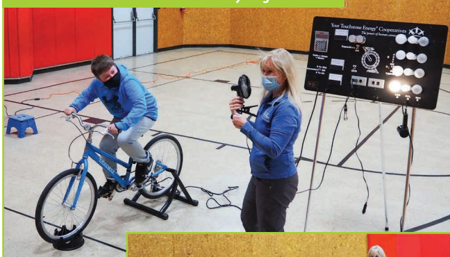
Tabor student on the Pedal Power bicycle generator