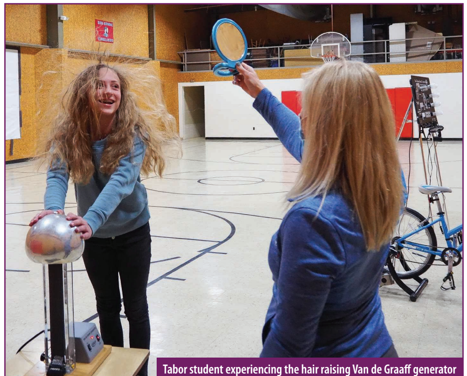
Tabor student experiencing the hair raising Van de Graaff generator

Gross also hooked up a fan and heating element to the human powered generator. The students first assume the fan takes more power but the heating element makes the bicycle almost impossible to pedal. Continued on page 10