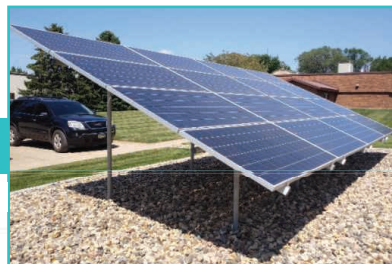
5 kW Solar array used by Bon Homme Yankton Electric since 2018